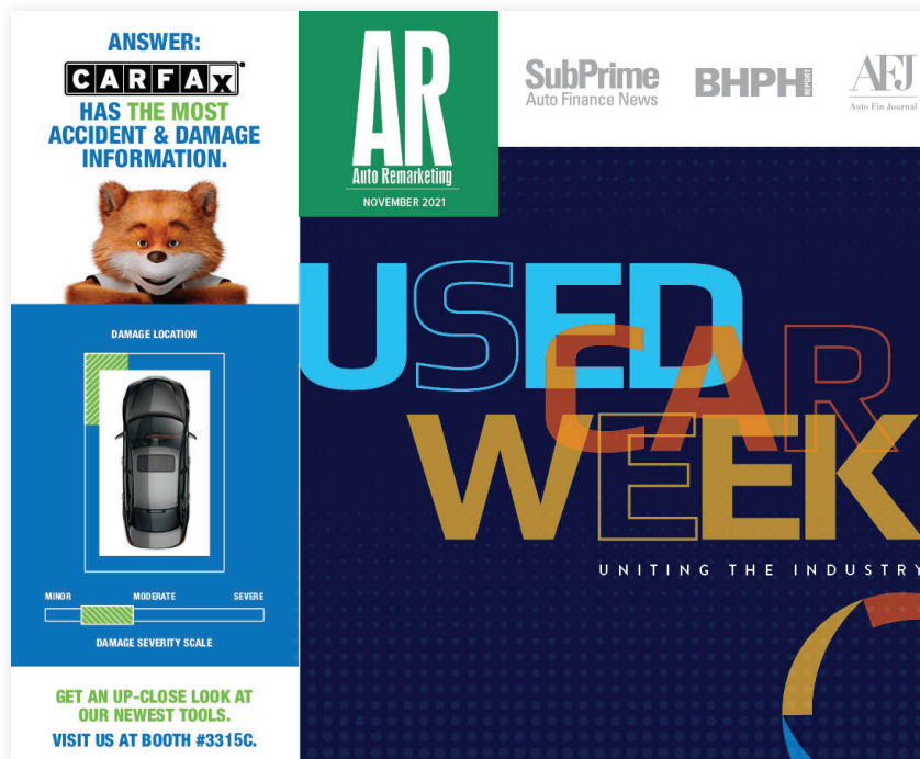
Inside Cover Wrap