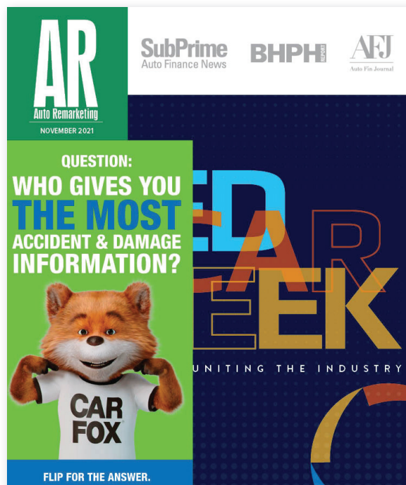
Outside Cover Wrap